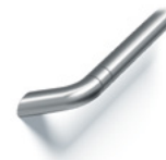
Bent silver brushed HR64