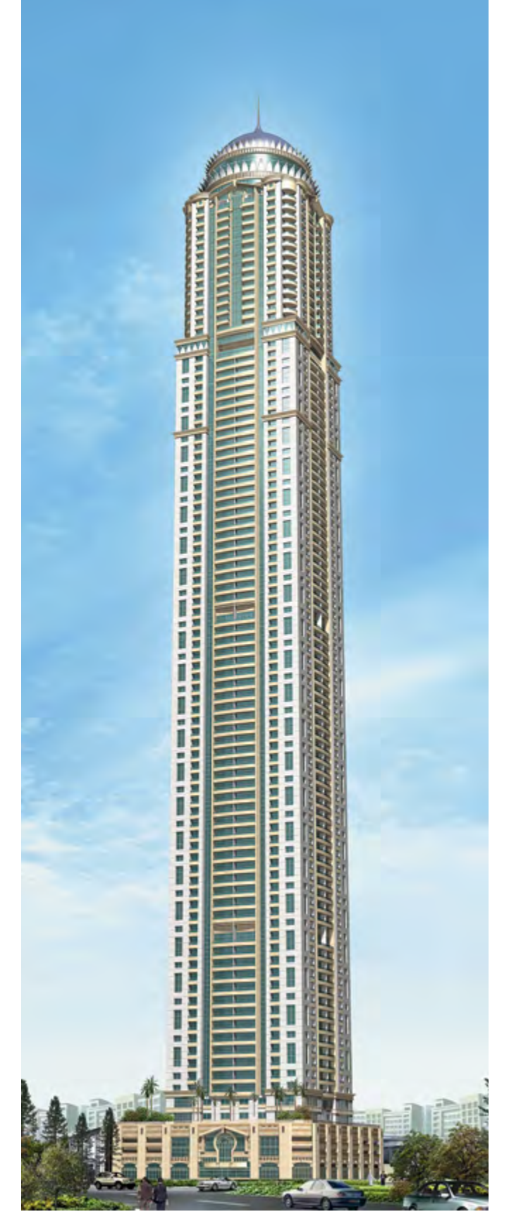
Princess Tower, Dubai