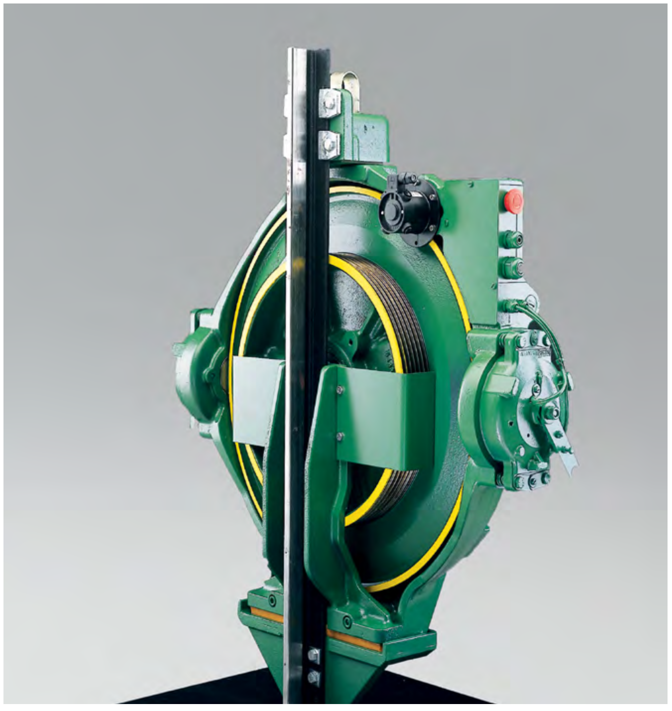
The eco-efficient KONE EcoDisc hoisting system

But the hoisting motor is not the only thing that can reduce the total energy consumption of an elevator. KONE has analysed every function and option in order to reduce the total energy consumption.