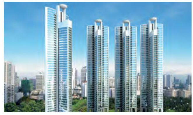
Millennium Residence, Bangkok, Thailand