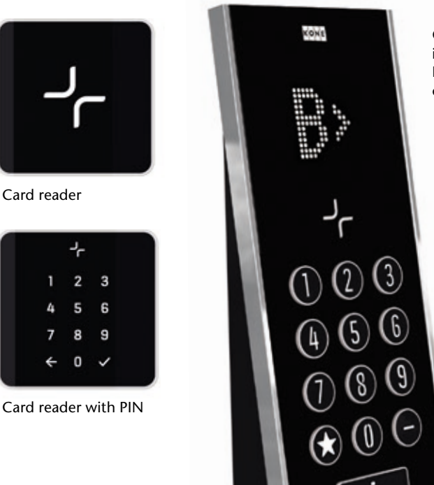
Card reader integrated with KSP 853 destination operating panel