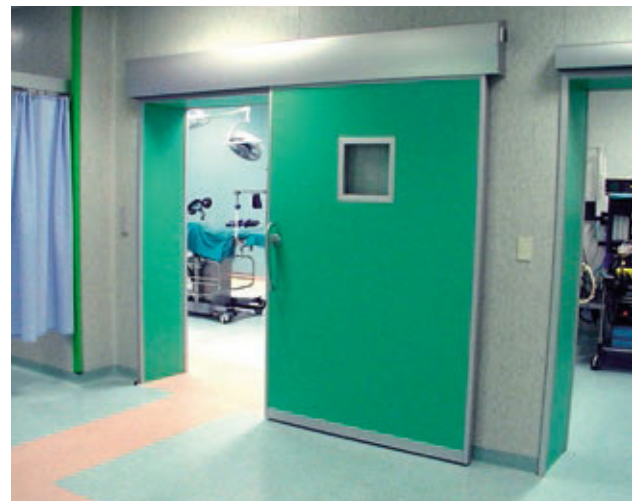
Single door, automatic operation.

A KONE hermetic sealing inside sliding door also has a space-saving safety feature. The moving panel of the door can slide into a sealed compartment to ensure that safety and space are maximised.