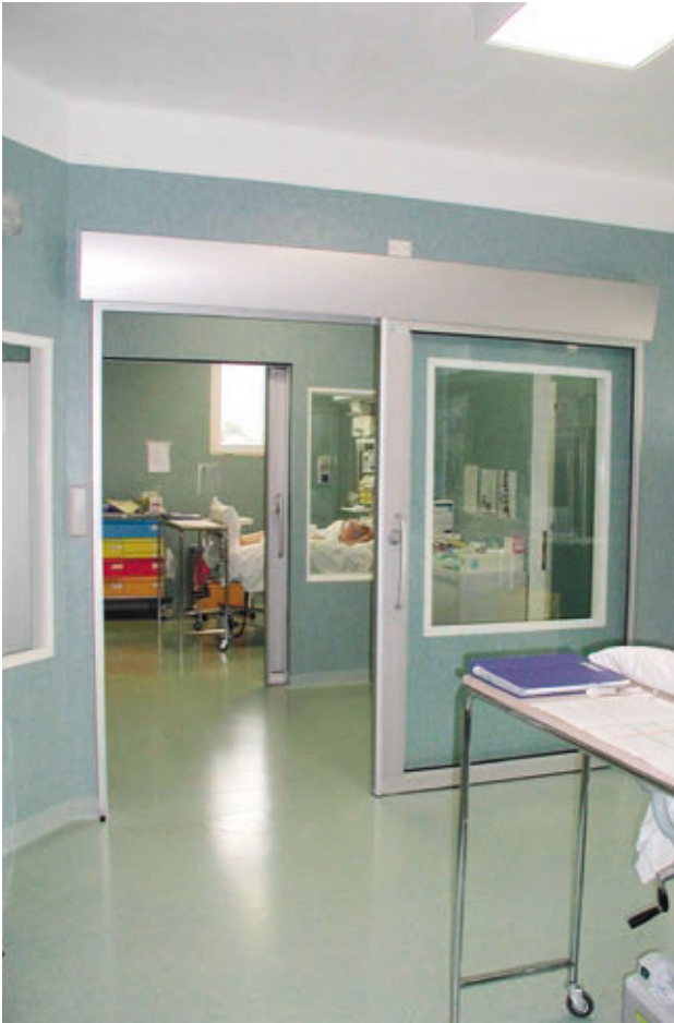
Single door, manual and automatic operation.